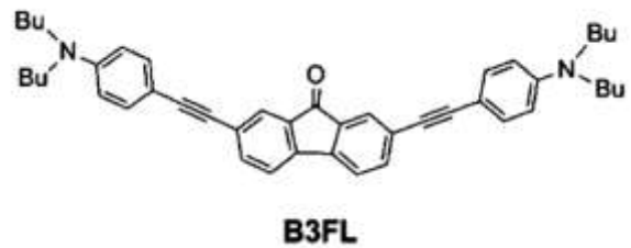
Fig. 1: molecular structure of the examined 2PI

A novel 2PI comprising of a cross-conjugated D- \pi -A- \pi -D system (Fig. 1), which contains aromatic ketone as acceptor, synthesized in Applied Synthetic chemistry in Vienna University of Technology was chosen for investigation.